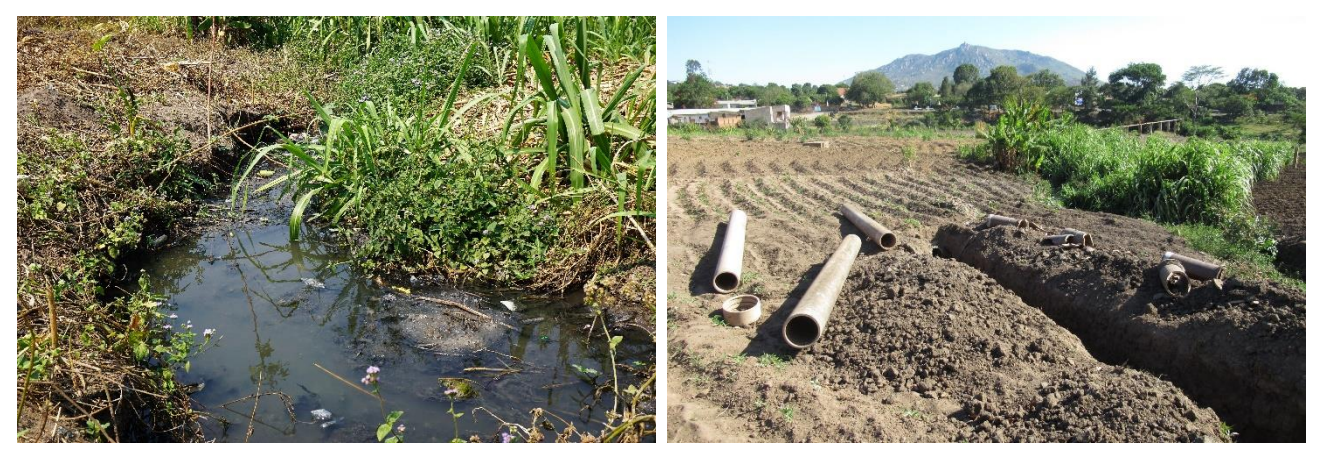
Untreated waste from sewage line

Wastewater from QECH is collected and treated at the Blantyre City treatment works, however it was found that the sewer line which transports all of the hospital's waste was broken some 300 meters from the site's boundary, and that the waste was flowing over residential and farm land and into the Naperi river. This situation posed a severe public health risk. Blantyre City Council are responsible for operation and maintenance of the sewerage network and the issue was taken up with them by the QECH team. QECH's engagement of the Council initiated the repair of the sewage line, ensuring the proper treatment of wastewater from the hospital and improving the water quality of the Naperi river.