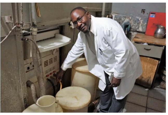
Disposal of chemical waste at QECH

It was observed during initial site visits that chemical waste from the hospital's laboratory and radiology department was being inappropriately disposed of through the sewer network, with an untold effect on water quality downstream. Upon learning of the regulations for chemical waste disposal, the site enlisted support from the Blantyre City Council to advise and support the hospital to implement proper chemical waste disposal and treatment, which is underway.