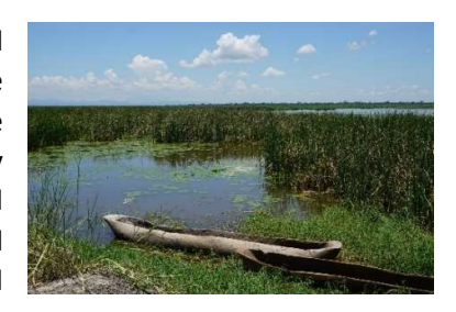
Elephant Marsh, a RAMSAR site

The Phata Sugarcane Outgrowers Cooperative (Phata) is located within the Mwanza sub-basin along the lower Shire River in the Shire River Basin, in Chikwawa district, Southern Malawi. The Mwanza sub-basin is a wide floodplain and hosts biodiversity hotpots in marshy areas. Around Phata are the Lengwe National Park to the South West, Majete Game Reserve to the North and Elephant Marsh, a RAMSAR designated wetland of international importance, to the South.