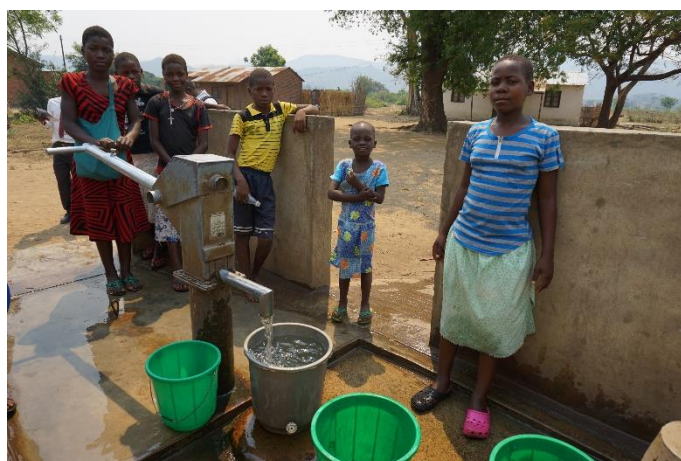
Borehole at Njereza Primary school

As part of AWS Standard implementation, the school reviewed the water governance arrangements of the borehole. Two teachers from Njereza Primary are now included on the Borehole Management Committee, and by-laws have been established which clearly set out the role of the Committee, and responsibilities of users. The by-laws prohibit activities in the immediate vicinity of the borehole which could cause contamination (such as washing or the grazing of animals), prioritise access for students, and set limits on abstraction during busy periods.