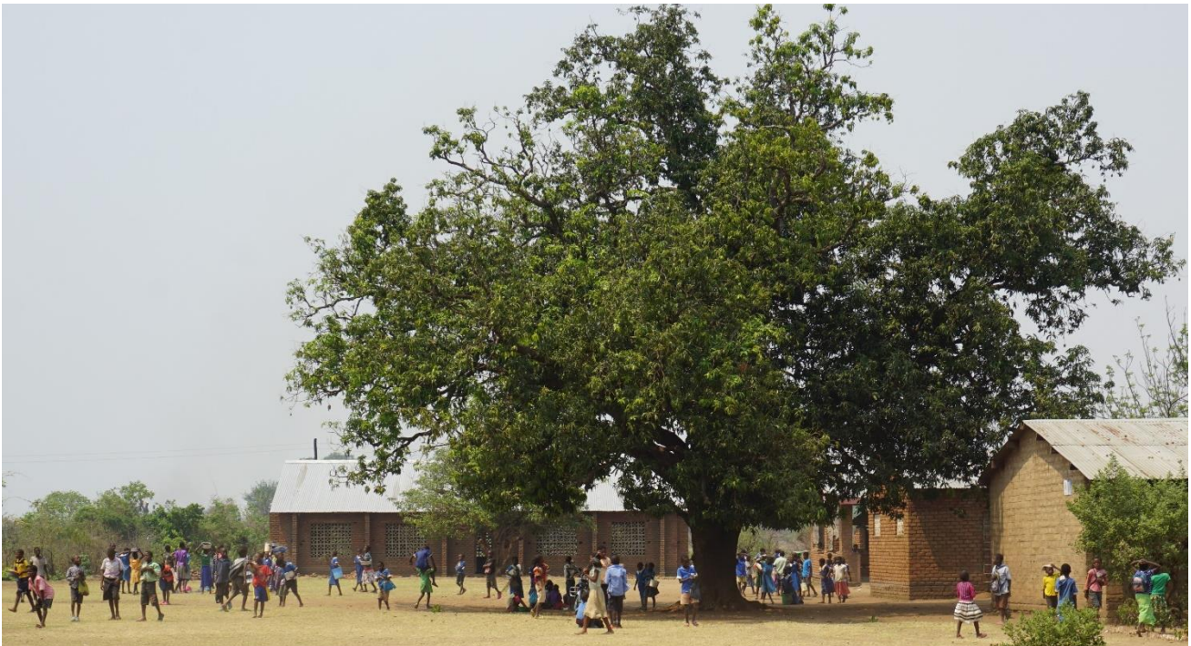
Njereza Primary school

The results, benefits and challenges are presented below, together with conclusions and recommendations for improving the AWS system and water stewardship practice in the education sector.