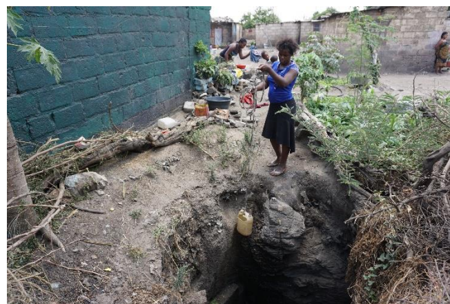
Unprotected shallow well in Kanyama

We try to fetch water from households with individual connections but they do not allow us... we have no other option but to go to shallow wells- Kanyama resident