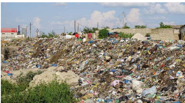
Dumped solid waste in Kanyama

According to Section 56 of the Environmental Management Act 2011, local authorities are responsible for the collection and disposal of solid waste. However, solid waste management on behalf of the Lusaka City Council is severely limited and sporadic (LCC, 2008). It is estimated that Lusaka produces 765 tonnes of solid waste daily, only 10% of which is collected and properly disposed of (BGR, 2011).