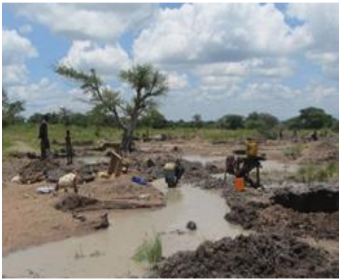
Plate 3. Stream bed gold mining in Makongolosi, Chunya

to the Ministry of Water (2016) they have been unable to effectively monitor and assess mining pollution problems because of a lack of facilities (see Box 1.) No water quality monitoring is carried out to track the risks.