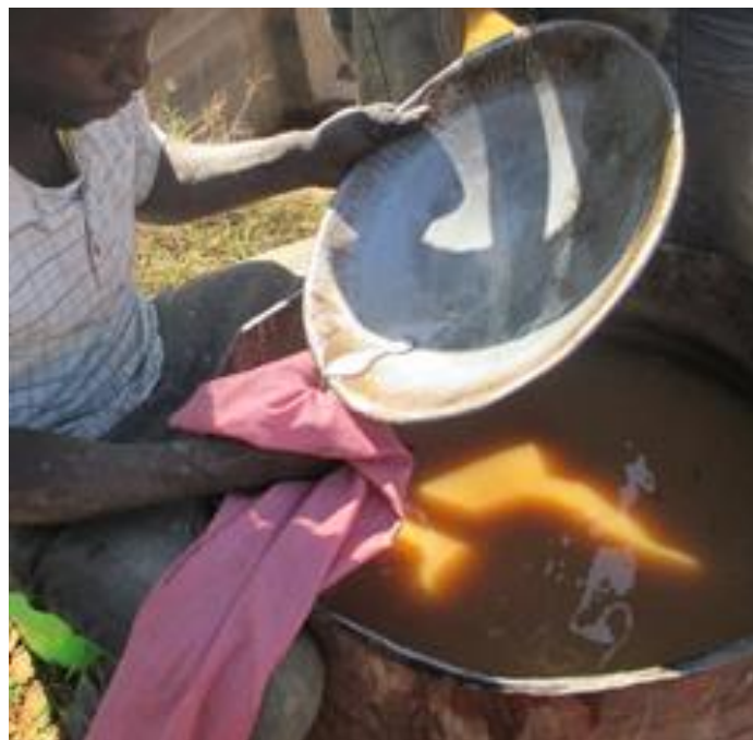
Plate 2. Mercury used as an amalgam prior to open burning by miners in Chunya.