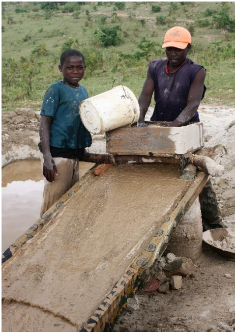
Plate 4: Sluicing creates significant pollution in ASGM

Community members, local leaders and those miners working with Itumbi Miners Association are very concerned about the uncontrolled impacts of ASGM in the District. In December 2017, they wrote to the authorities including the District Council, Zonal Mining Office, Lake Rukwa Basin Water Board and the National Environmental Management Council with an urgent request to: