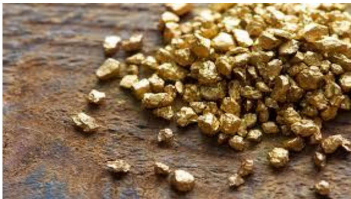
Plate 1. ASGM produces 10% of Tanzania's gold output and supports livelihoods of up to 4.5 million people.

Chunya District is endowed with one of the country's major gold fields and is well known for its non-alluvial gold. Itumbi and Matundasi are very productive mining sites located 20 km from Chunya District headquarters. Mining activities began there during colonial times. There are more than 70 licenced small-scale miners, and a substantial number of unlicensed miners operating illegally.